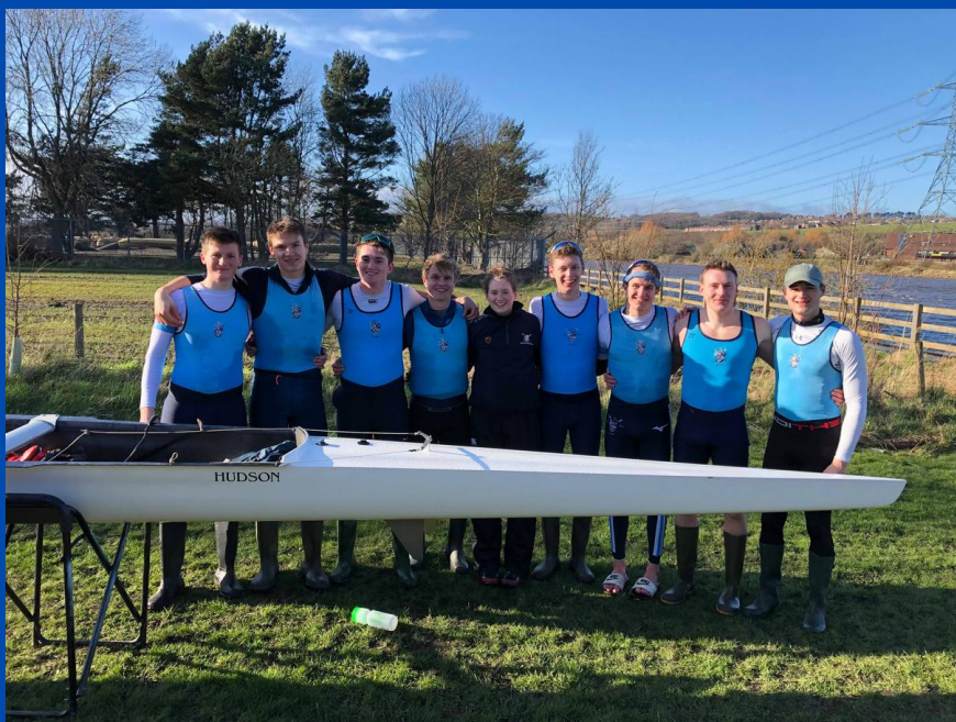
The Senior Men's 1st VIII

Only a few weeks after TURC New Years Head, the lads took to the Tyne once again for BUCS, and put in a stellar effort considering there were waves big enough to surf!... It's all the more impressive considering a significant number of them were having a large one at the fashion show the night before - there are no half measures in Hild Bede!