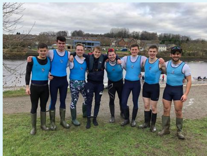
Senior Men's 2nd VIII