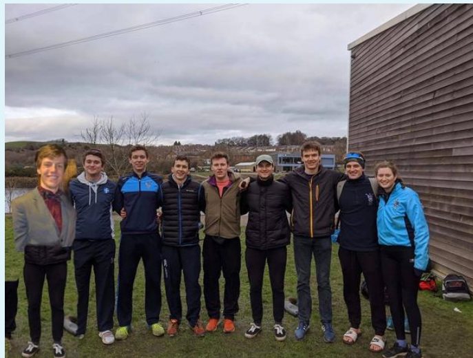
Senior Men's 1st VIII

Both men's VIII's put in stellar performances, with M1 being the fastest college, beating the next by 30 seconds as well as several university crews. M2 were the fastest 2nd VIII, as well as taking a college 1st VIII too. Needless to say, the highlight of the day was undoubtedly the celebratory MacDonalds afterwards!